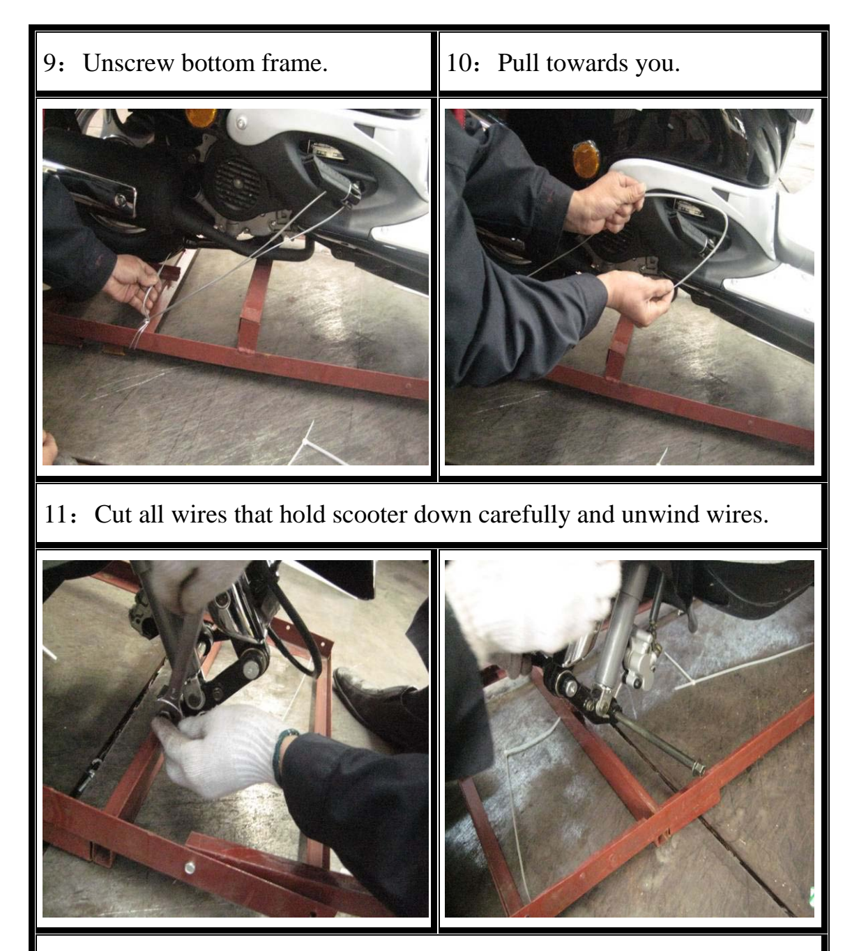
12: Carefully un-bolt the main shaft for front wheel installation.