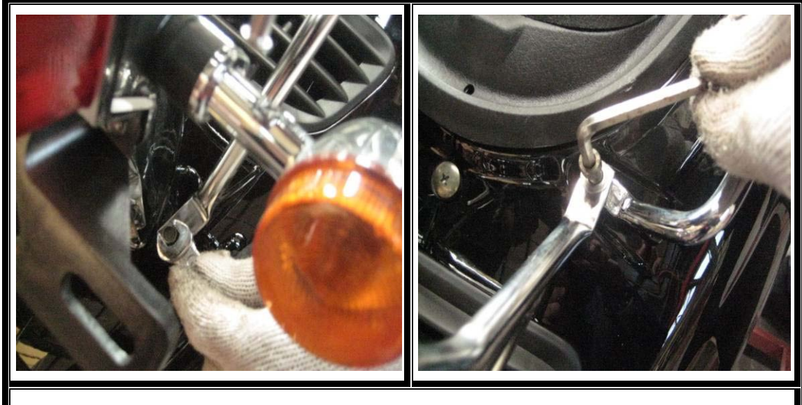
25: Secure all rear bolts with tool from the tool kit.